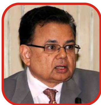
Justice DALVEER BHANDARI

Former Minister of State Law and Justice