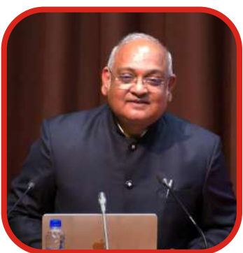
Justice DINESH MAHESHWARI