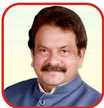
Shri. S P SINGH BAGHEL

Former Minister of State Law and Justice