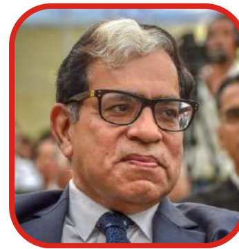
Justice A K SIKRI

Former Judge, International Court of Justice