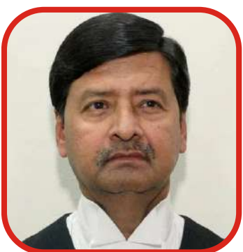
Justice AJAY RASTOGI